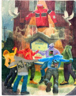
All Hellys Go to Heaven, 2025

Inkjet image transfer, gouache, and color pencil on wood canvas