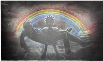
Rhonda, Our Last Hope, 2020