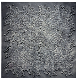
The Pocket, 2026

Acrylic and resin-casted tiles on cradled wood canvas