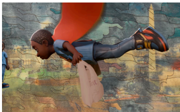
Man of the Sky, 2026

Video (3D animation, ink-transfer, and paint on laser-cut wood tessellation), color, and sound