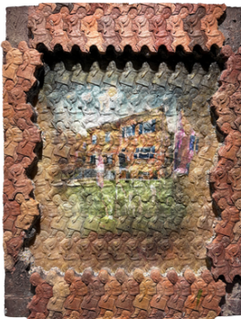
The Long Way Home, 2026

Acrylic, laser jet transfer, and casted foam on carved XPs foam