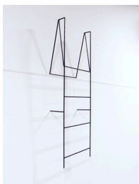
Jung Won Lee Morning Comfort , 2023 Acrylic on steel 12 ¼ × 5 ¼ × 38 ½ inches Not for sale