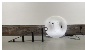
Jung Won Lee & Paz Sher Buried Moon , 2025 Acrylic on steel, epoxy and spray paint on acrylic dimensions variable $4,000