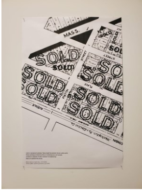
mass ave heights map, c. 1917, 2022

Digital illustration on enhanced matte paper