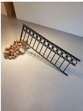
hate has no home here, but it does keep an apartment , 2022 Found brick and decorative landscaping fence Dimensions variable Not for sale