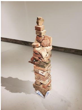
unrepresented, but present, 2022