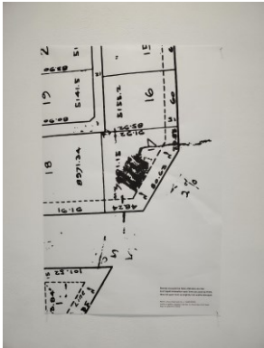
chevy chase land co., c. 1942 , 2022 Digital illustration on enhanced matte paper 36 x 24 inches Not for sale