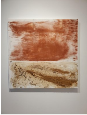
lock twenty-five (quiet!—put it in park) , 2021 Gesso, soil (Delanco silt loam and Rowland silt loam), and brick dust on canvas 40 x 40 inches Not for sale