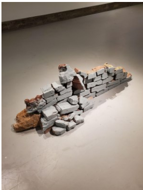
gentrification gray , 2022 Found brick, concrete, and latex paint Dimensions variable Not for sale